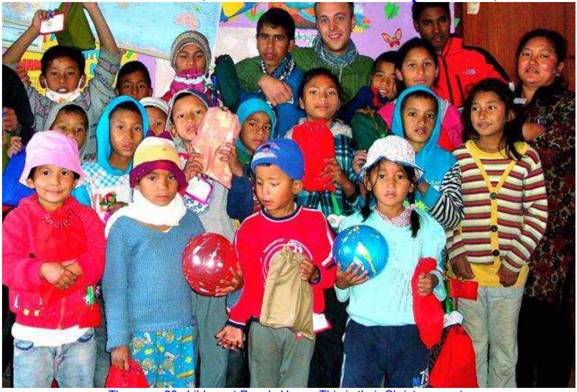
There are 23 children at Papa's Home. This is their Christmas party