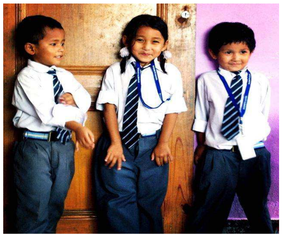
The children at Papa's love going to school

Street children have no permanent place to sleep and no one to care for them. They depend on the street for everything they need to survive. They find themselves on the street for a variety of reasons, such as family breakdown, unplanned rural-urban migration, child abuse, and neglect and peer pressure.