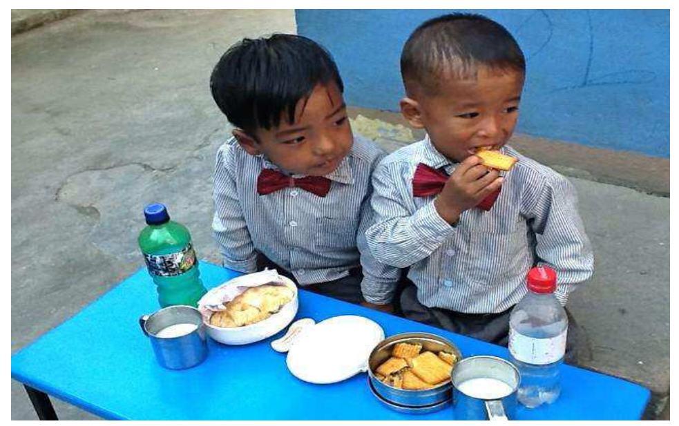
Children at Triple Gem enjoying their daily cup of milk

I am delighted to report we have enjoyed another successful year