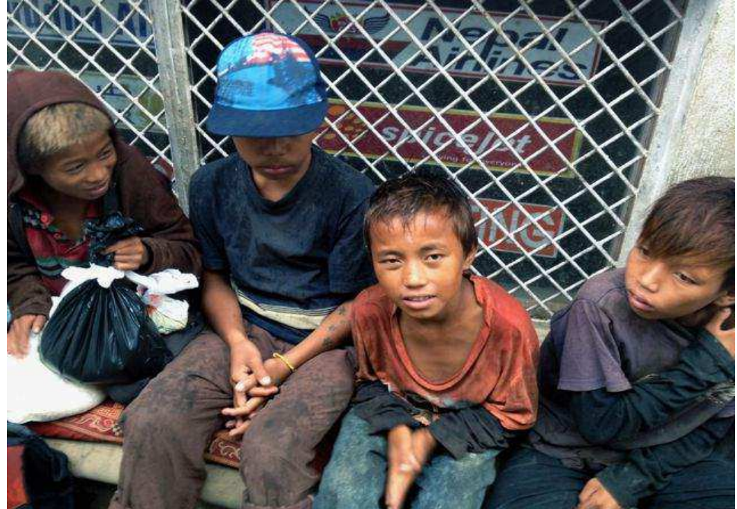
We also provide a daily hot meal for 12 children living on the street.

Twice a year, during the coldest months, November to January, we fund the distribution of roll out mattresses, blankets and warm clothes at two venues in Kathmandu. This is organised by Anamika in conjunction with VFN.