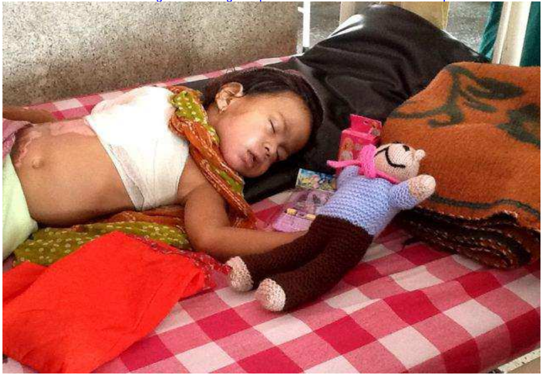
The Herrod Foundation, a Swiss Charitable Trust has funded the skin graft operations and specialised creams for 25 patients during the year.

Child recovering after a skin graft operation at the Kanti Children's Hospital