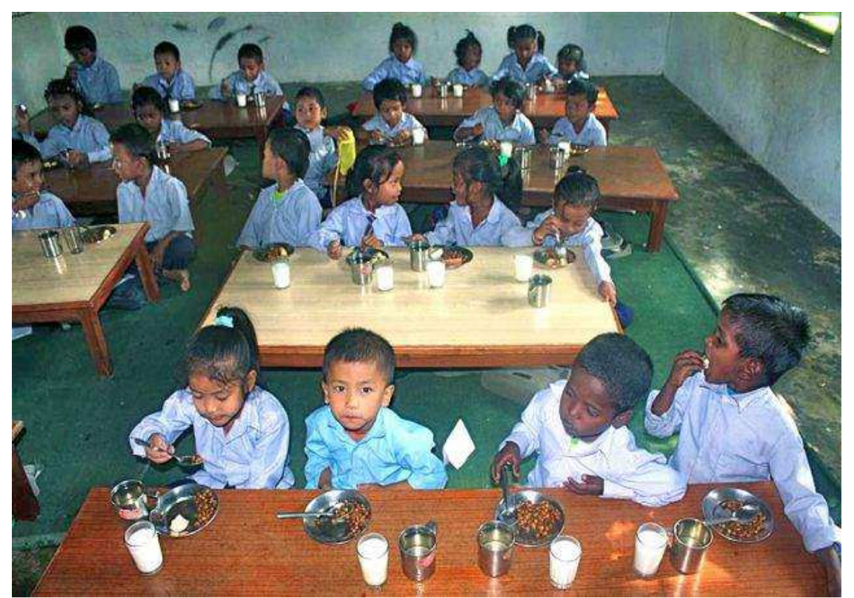
Midday snack at Shree Secondary School

We are delighted to be supporting the nursery and kindergarten classes at this school. We fund a midday snack, which consists of noodles, with egg or dhal and sometimes fresh fruit and milk. Both teachers and parents are delighted with the children's improved attendance and concentration due to this meal.