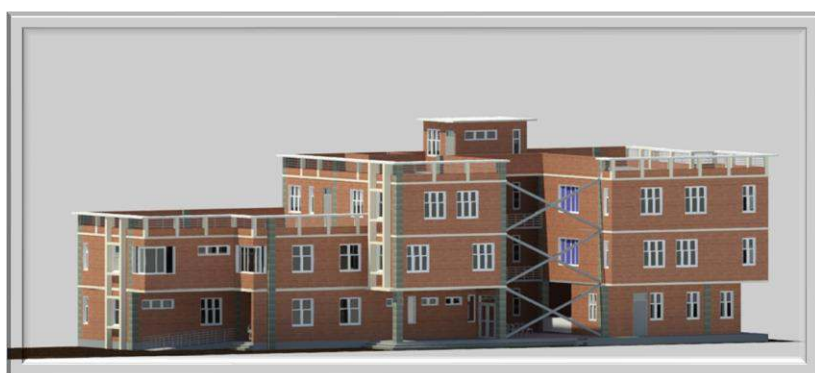
The new design for a multi-storey hospital

The construction of the initial 15 bedded hospital is funded by Direct Relief, USA."