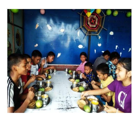
Food programme at Papa's