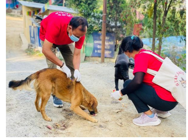
Children also help with the rabies Vaccinations