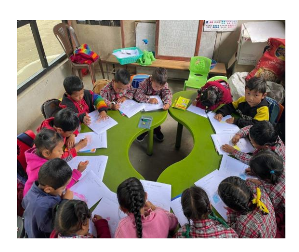
Thank you Brampton Charitable Trust – new tables and chairs