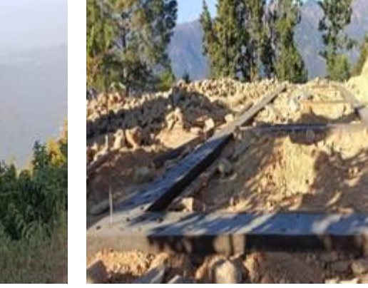
Red flag donates the area of the school