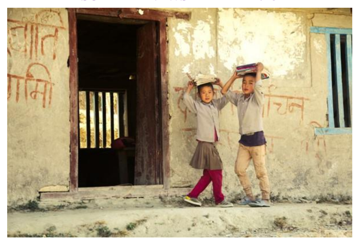
If you don't have a satchel for school, there's always another way!

I have pleasure in sharing our Summer Newsletter showing our activities for the first half of 2023. Nepal is now in the monsoon season, rain, rain and more rain, with humid temperatures.