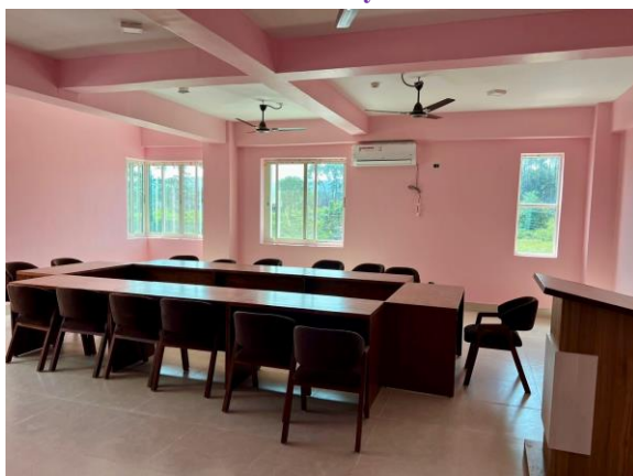
Seminar and training room