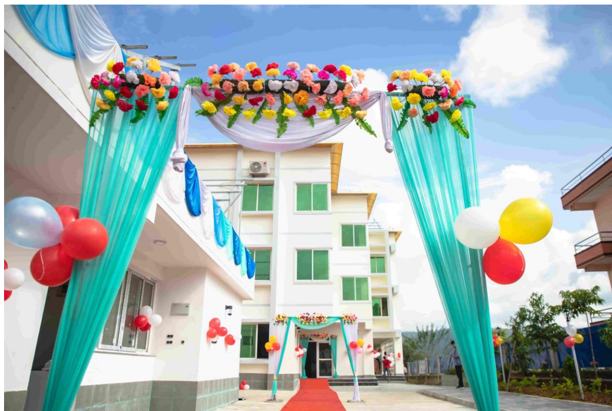
Inauguration of Siddhasthali Rural Community Hospital - Hetauda

May I start by wishing you all a very Happy New Year and may 2024 be filled with good health, happiness and loving kindness.