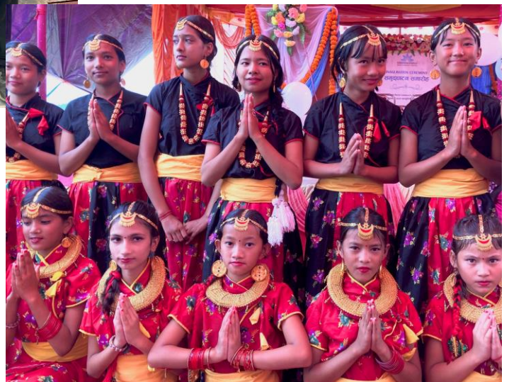
Beautiful dancing girls