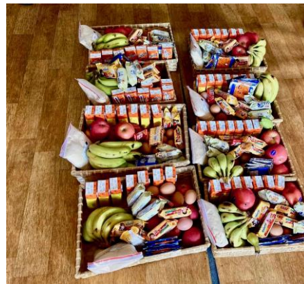
Nutritious food baskets