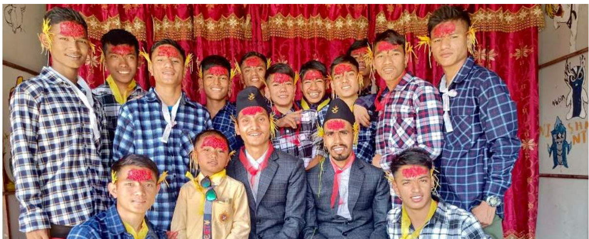
The VFN family