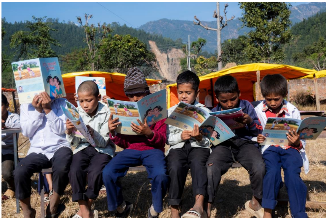
Our 'Magic Read' programme reaches far and wide