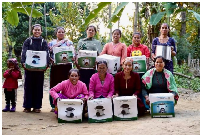
Some of the ladies who received a cooking stove

This year we provided 30 cooking stoves for the marginalised Chepang in Chitwan, 15 from funds raised at one of our quiz nights, and 15 from a donation by Jane Lewis. The improved Smart Stove is a tool designed to reduce the emission of harmful gases and consumption of firewood while cooking. It has an insulated combustion chamber around and above the fire, which enhances the temperature of the fire with reduction in firewood and decreases emissions of carbon dioxide and particulate matter. These stoves are very useful in rural areas where people have increasing rates of respiratory diseases.