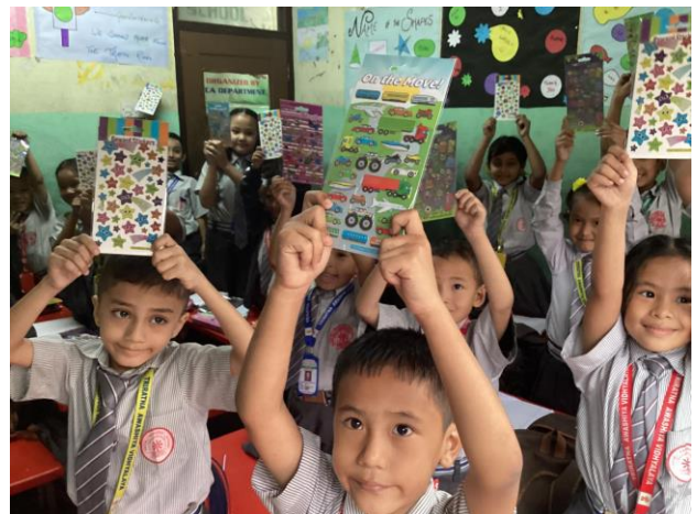
Children the world over love stickers

I then visited the lower school during the milk distribution we support and handed out stickers and our knitted dolls.