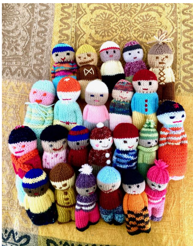
Knitted with love from England

We were then invited back to the BVS office where they had prepared a delicious lunch and we handed over hundreds of knitted dolls, stickers and toothbrushes brought out from the UK.