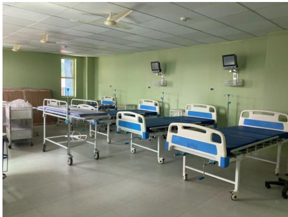
One of the wards

Before the festivities began, Anil, the proud architect, gave me a conducted tour inside the hospital. He and Dr Aban had really thought of everything! ...the site is carbon neutral, with solar panels which will provide all the electricity and huge double-glazed windows that bathed the interior in natural light to provide beautiful views over unspoiled countryside. The 60' borehole will provide water and a purpose-built oxygen producing plant is on site (a very rare facility). The first phase of 15 hospital beds, monitors and emergency trolleys were on the wards, all donated by CHANCE .... i.e. you lovely people; along with a state-of-the-art Digital Medical X-ray Radiographic System - the envy of other hospitals in the province - with the funds raised from our on-line auction held at the end of April. Housed in a separate building, the pharmacy, medical store and a small café, the construction of which was generously donated by Edmund O'Reilly Hyland, our longest serving trustee.