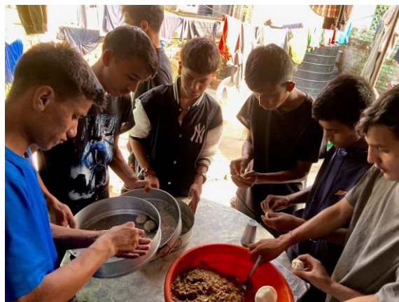
In my honour we made momos!

Another enjoyable and fun day for me was spent when invited back to help them make momos, my favourite Nepali dish! This took over four hours, with all hands to the task, preparing from scratch enough for all 16 of us! Not a case of opening a tin of tomatoes or a jar of peanut butter for a sauce. No! First the peanuts were gently fried to remove the husks, then sieved and ground up for the satay sauce, no half measurers! The chicken was stripped clean of all edible meat and the bones used to make a tasty soup to go with the momos which were delicious in the extreme and disappeared in seconds! I am immensely proud of all at VFN, the way they all pull together and the wonderful connection they have with each other - one very happy family, well done to all.